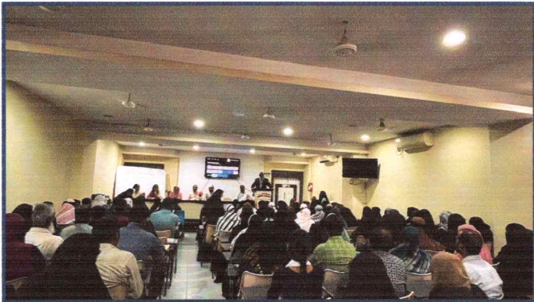
QC MEMBERS INTERACTING WITH PRINCIPAL