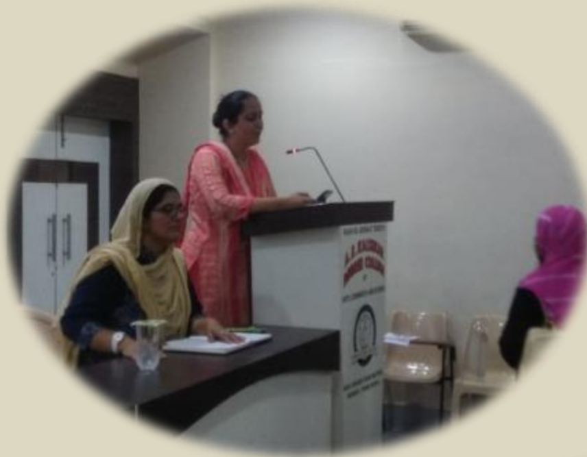
Workshop on Use of E-resource on 29/07/2019