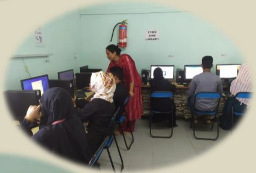
Workshop on Awareness of NPTEL Courses on 30/07/2019