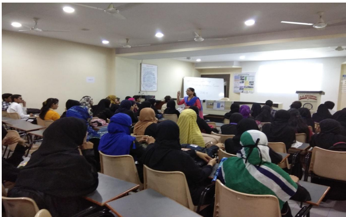
Students attending Avishkar Research Convention Orientation programme