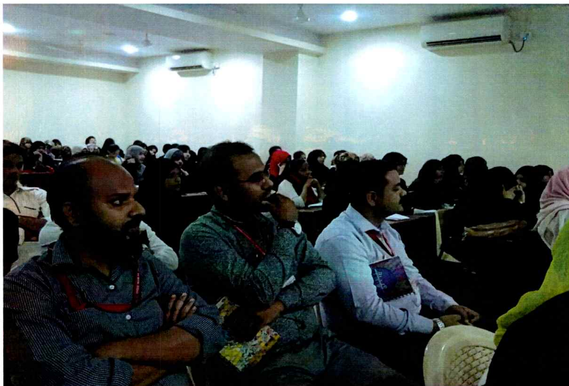
Faculties and Students attending the Workshop in Seminar Room