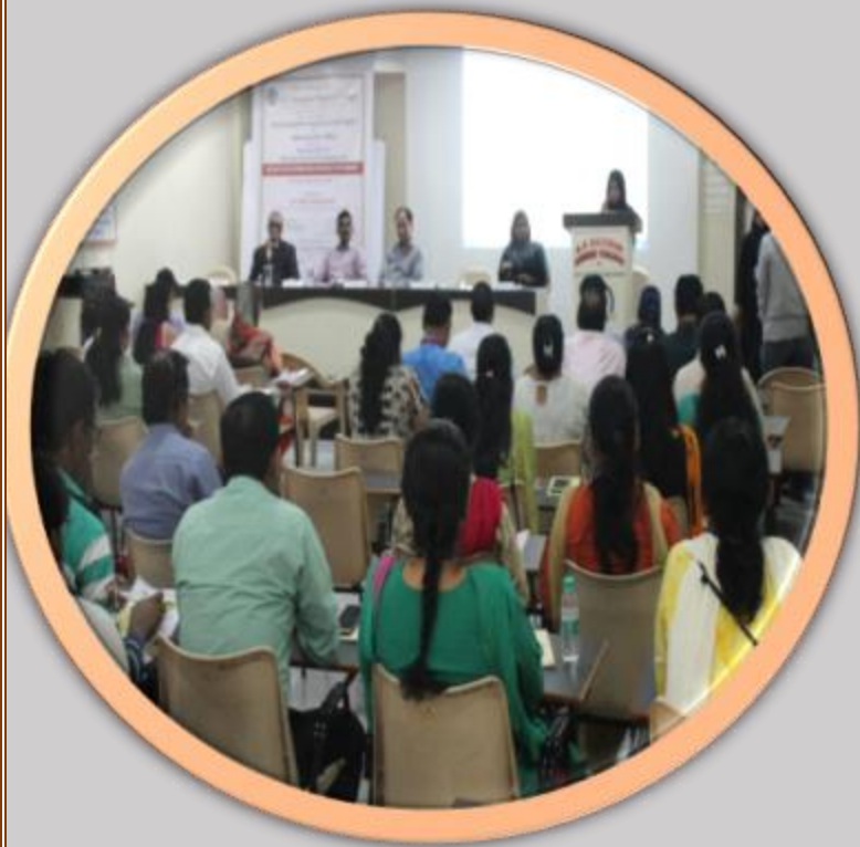
Workshop on Guidelines for Office documentation/ Automation and 7th Pay Commission on 16/02/2019