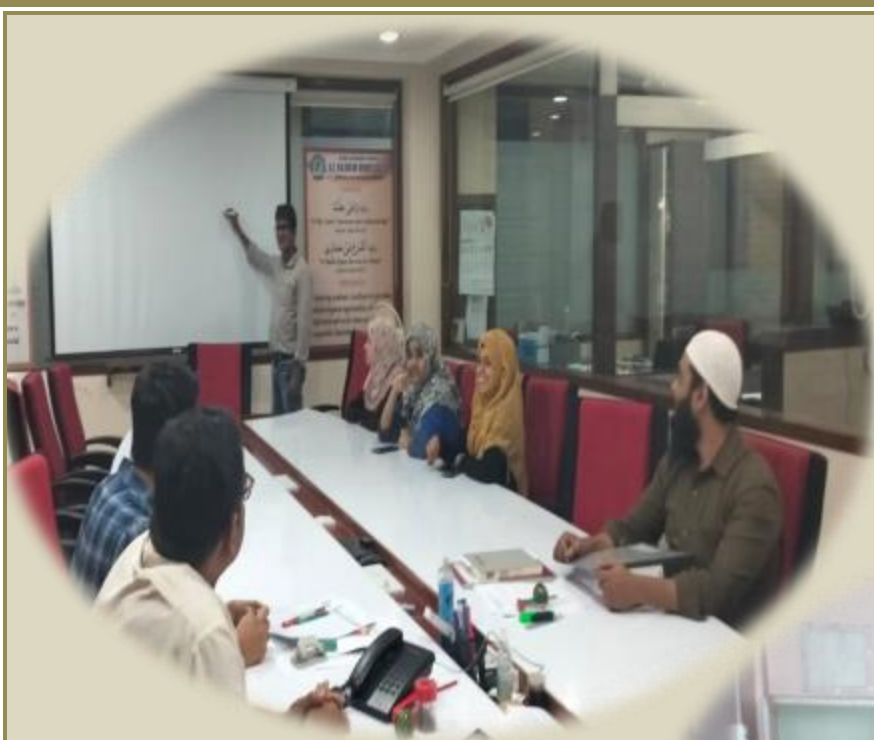
workshop on Office Documentation and Software training on 12/09/2019