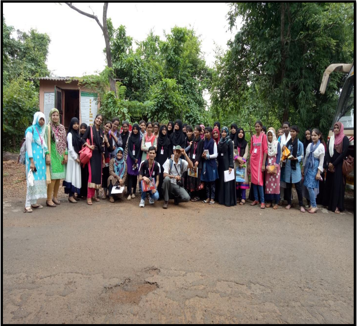
Educational visit to Go Green Nursery