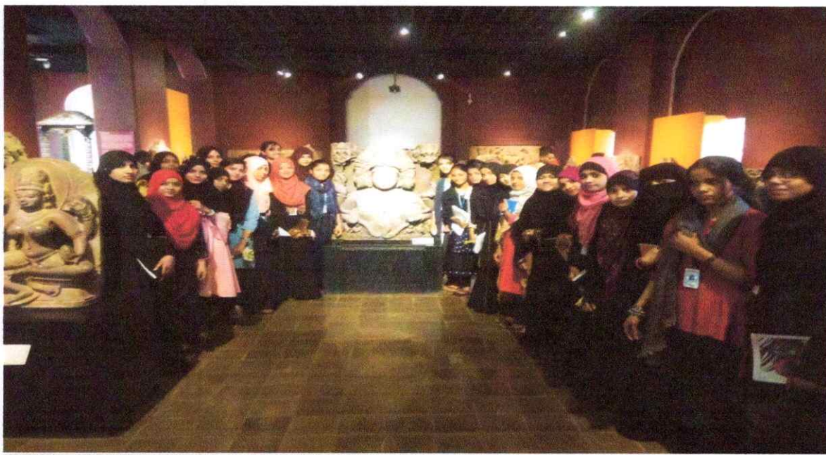
19 TH JAN, 2019- EXCURSION TO (CSMVS )GROUP PHOTO 1