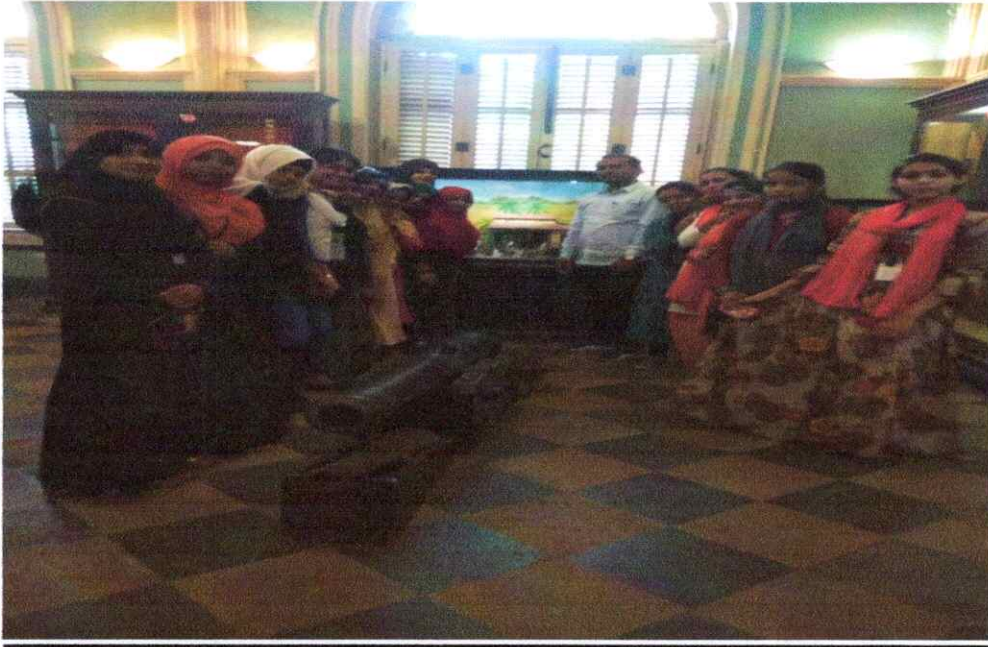
19 TH JAN, 2019- EXCURSION TO BHAU DAJI LAD - GROUP PHOTO 3

KAUSA, MUMBRA Permanently Affiliated to University of Mumbai Accredited by NAAC with B++ Grade ISO certified 9001:2015