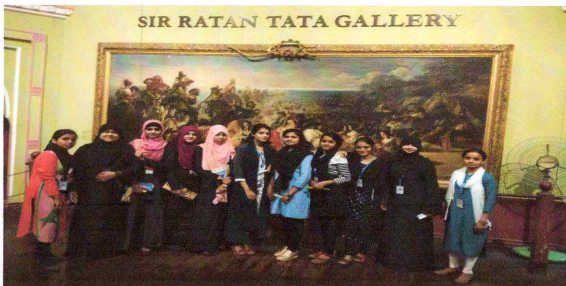
19 TH JAN, 2019- EXCURSION TO (CSMVS) GROUP PHOTO 2