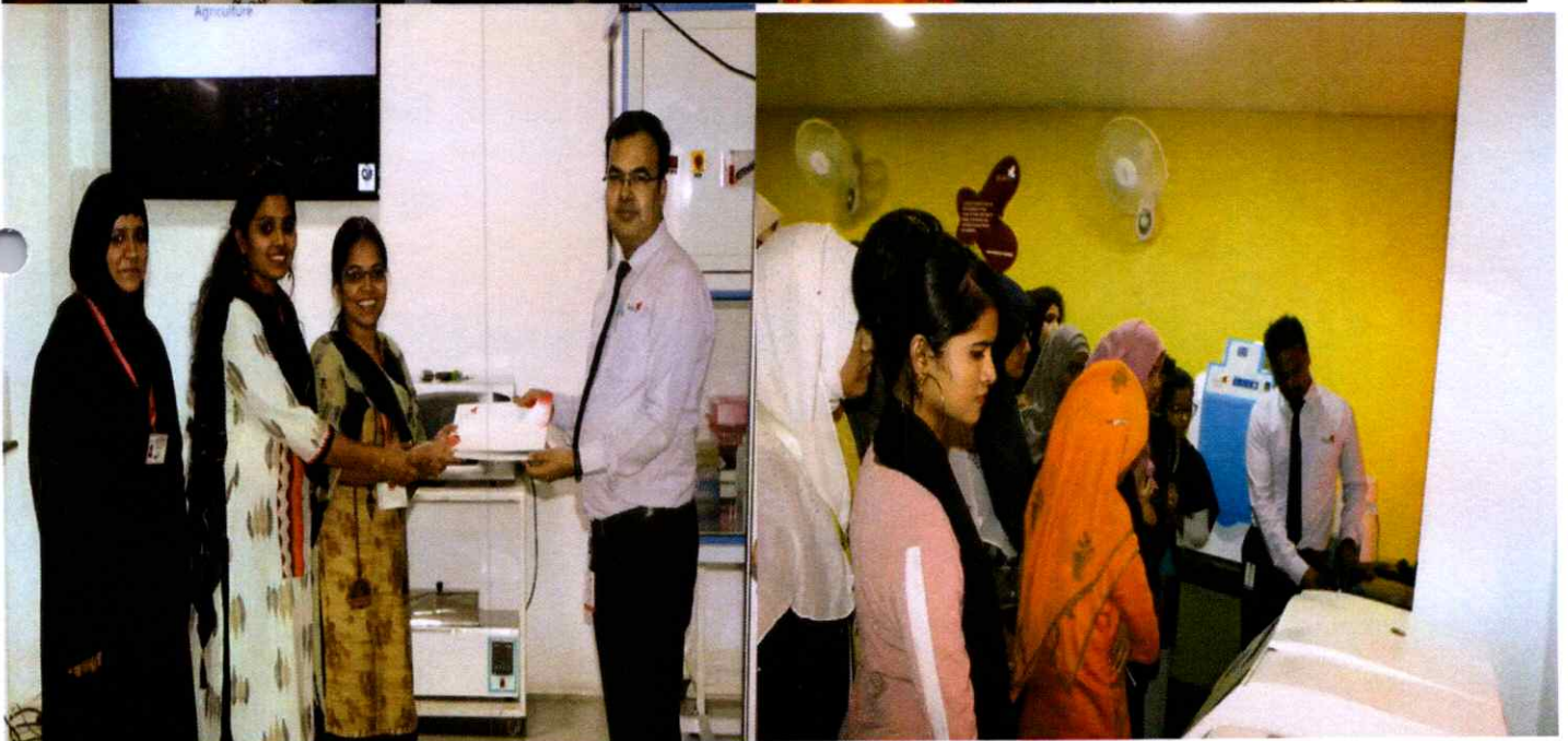
Students and Staff members at Bio- Era Life Science Centre attending Industrial Tour Cum Workshop