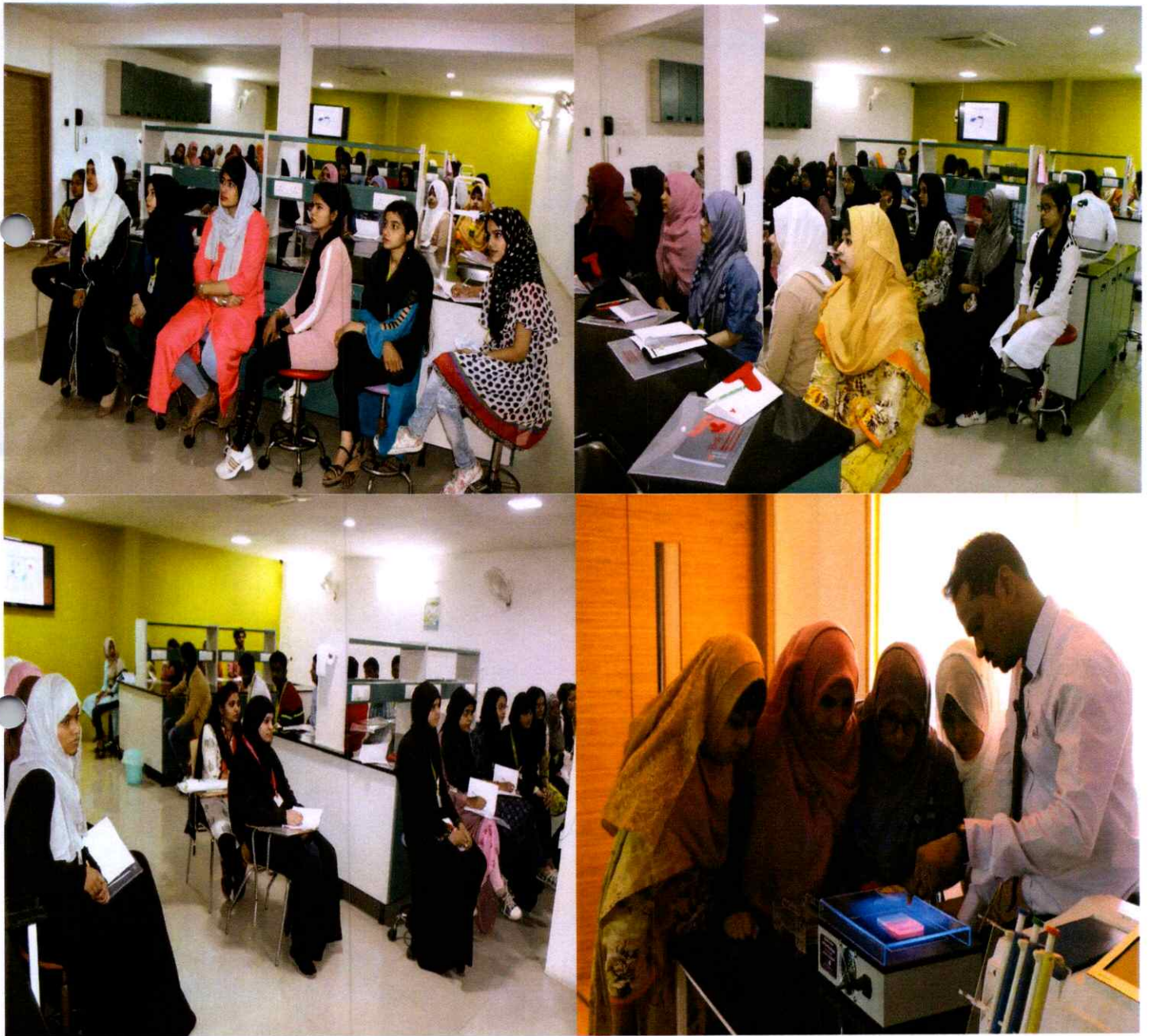
Students and Staff members at Bio- Era Life Science Centre attending Industrial Tour Cum Workshop

Industrial Visit at Bio Era Life Science Centre on 11 th February 2020