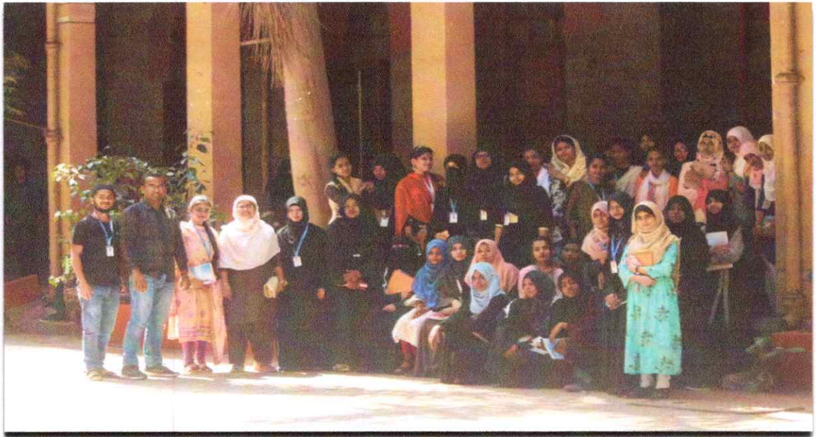
25 th February, 2020 - EXCURSION TO DIRECTORATE OF ARCHIVES