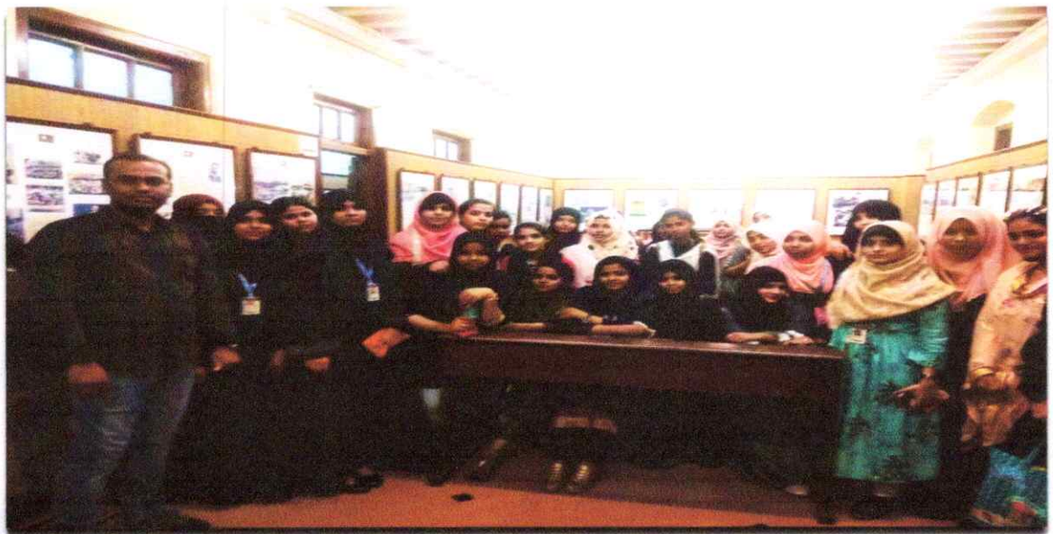
25 th February, 2020 - EXCURSION TO MANI BHAVAN