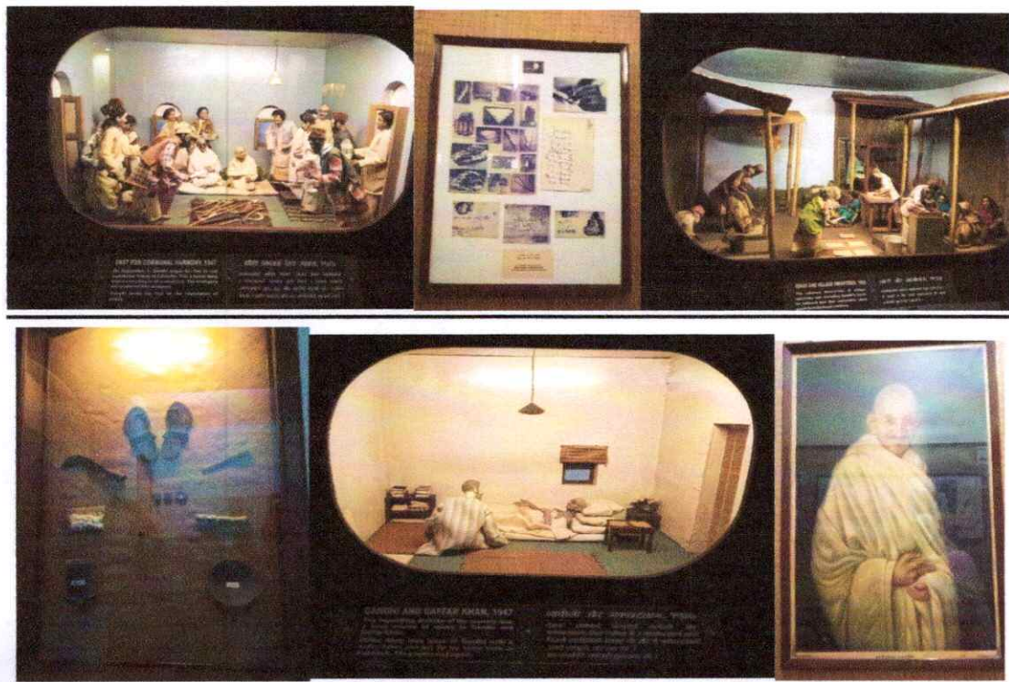
25 th February, 2020 – VISIT TO MANI BHAVAN